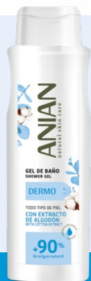
Shower gel - 750ml 8414716030756

Gently cleanses all skin types. Soft and cared-for skin.