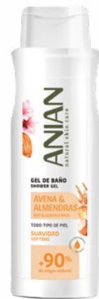
Shower gel - 750ml 8414716031753

Gently cleanses even sensitive skin. Helps to moisturise and soothe the skin.