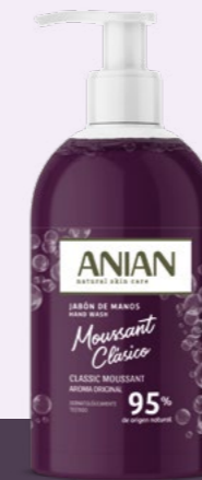
Hand soap - 500ml 8414716011250

Cleanses while offering an experience of use, with a traditional aroma and an evocative effect.