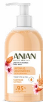
Hand Soap - 500ml 8414716011151

It also contains shea butter and allantoin. Nourished and supple skin.