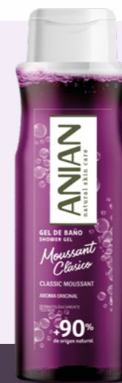
Shower gel - 750ml 8414716037076

TRADITIONAL AROMA / + 90% NATURAL ORIGIN