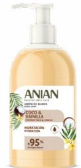
Hand Soap - 500ml 8414716000056

It also contains shea butter and allantoin. Soft and nourished skin, with a sweet aroma.