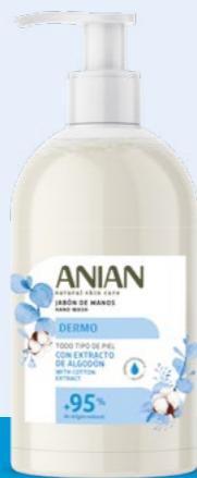
Hand Soap - 500ml 8414716011052

Gently cleanses all skin types. Soft and cared-for skin.