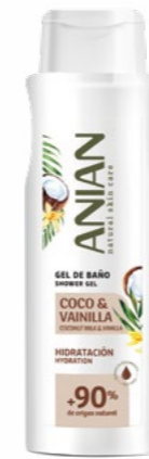
Shower gel - 750ml 8414716034754

Cleanses, moisturises and softens. Its sensual aroma envelops the skin with summery notes.